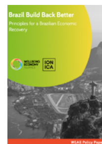
Brazil Build Back Better English | Portuguese