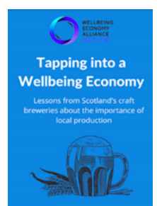
Tapping into a Wellbeing Economy