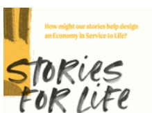
Stories For Life