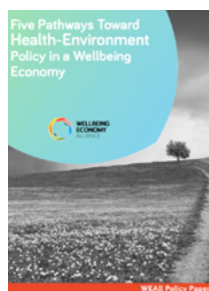
Health & Environment in the Wellbeing Economy