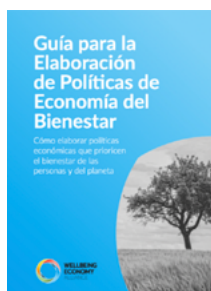
Policy Design Guide English | Español