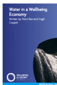
Water in the Wellbeing Economy