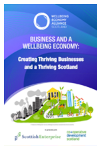
Business and the Wellbeing Economy